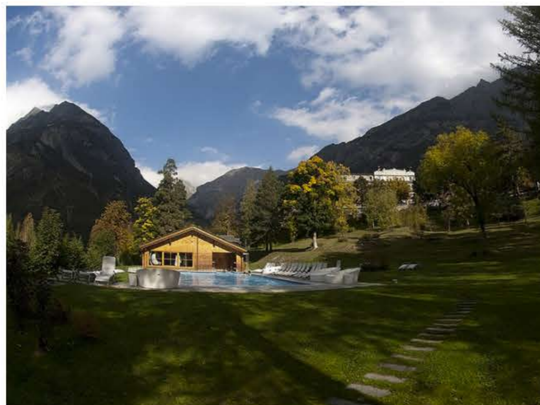
Fiam for QC Terme - Bagni di Bormio