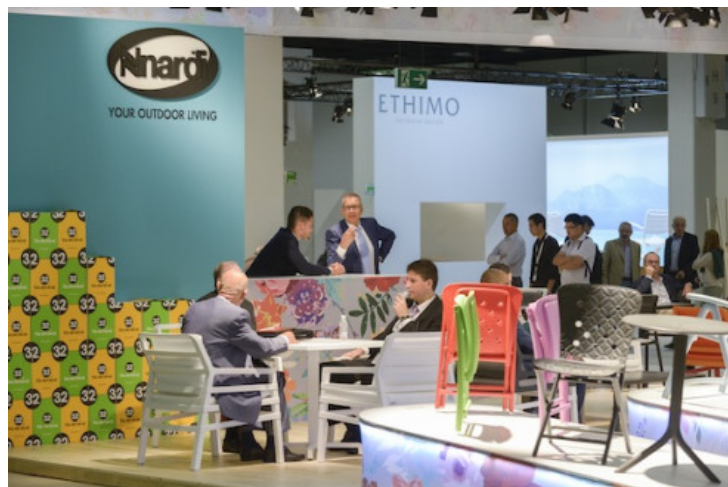
garden unique 2014, Foto: © Koelnmesse

A succesful event of garden unique 2014 came to an end. We are looking forward to welcome you again next year. In 2015, the spoga+gafa will take place from 30 August to 1 September.