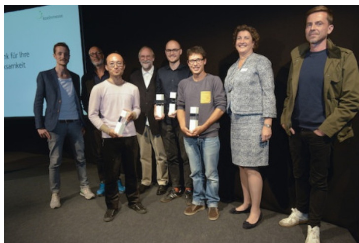
award ceremony unique youngstar 2014

The winners of the unique youngstars 2014 have been selected: During the unique hour, the winners of this year's young designer competition were announced. Three jury prizes and a public prize were up for grabs at the opening day.